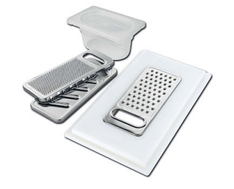
Graters kit with ring-holder and food collection tray 8159 101 * only in combination with the accessory 8644 101